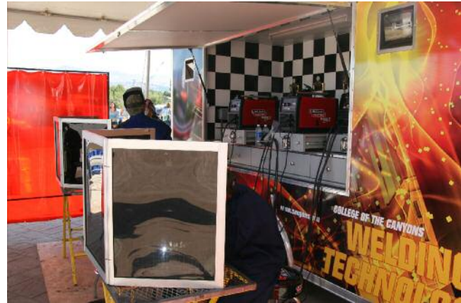
The 16-foot "roadshow trailer" goes to area schools to demonstrate welding skills and benefits of a welding career.