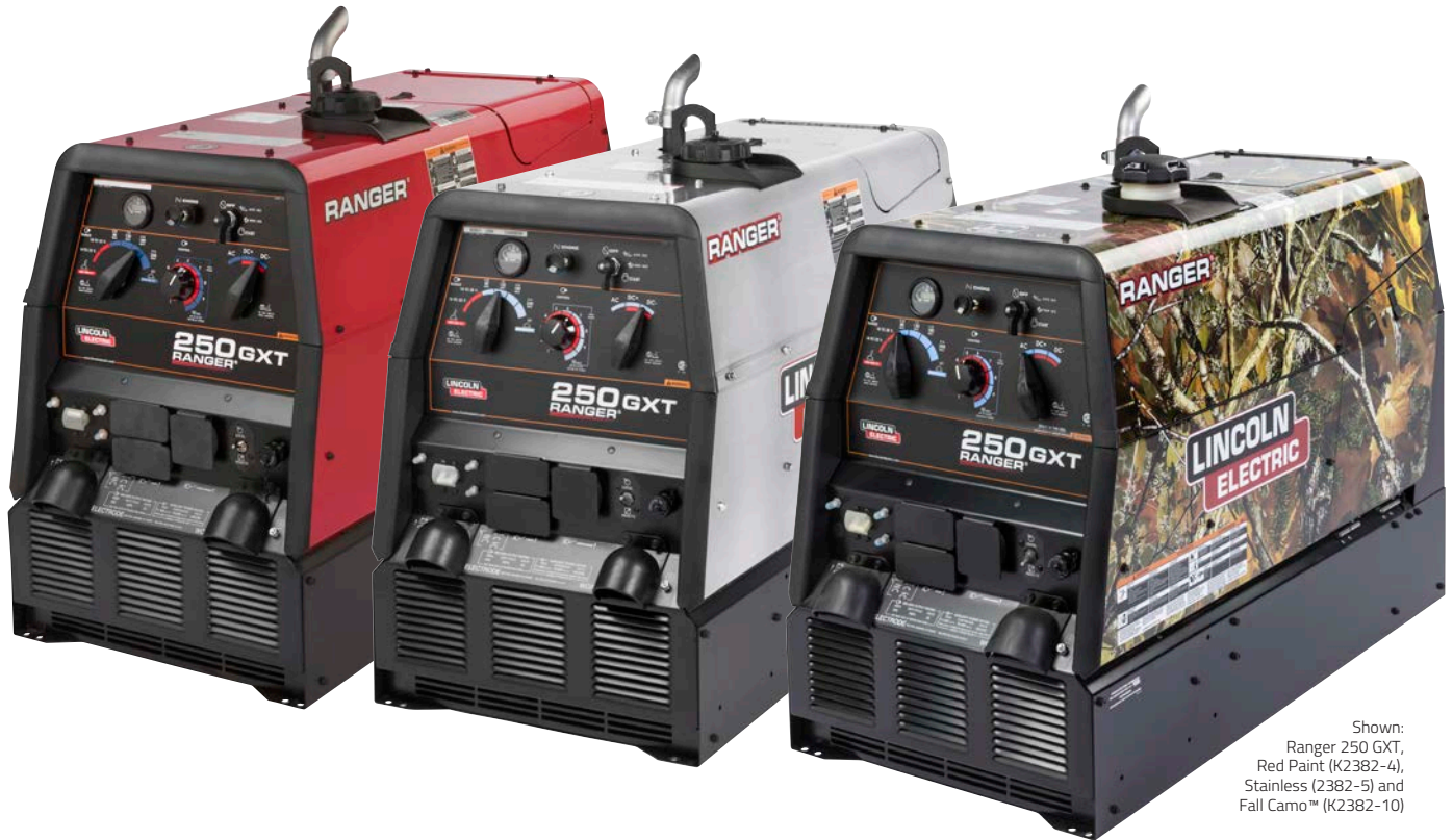
Shown: Ranger 250 GXT, Red Paint (K2382-4), Stainless (2382-5) and Fall Camo™ (K2382-10)