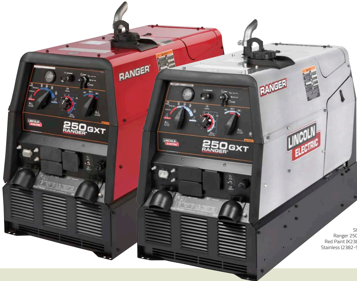
Shown: Ranger 250 GXT, Red Paint (K2382-4), Stainless (2382-5) and