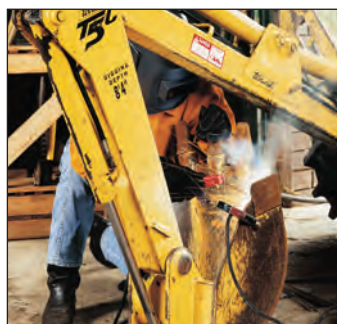
AC stick welding