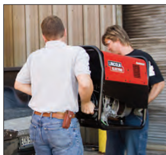
Low-Lift™ Grab Bars