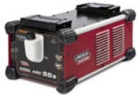
Shown: Cool Arc 55 S