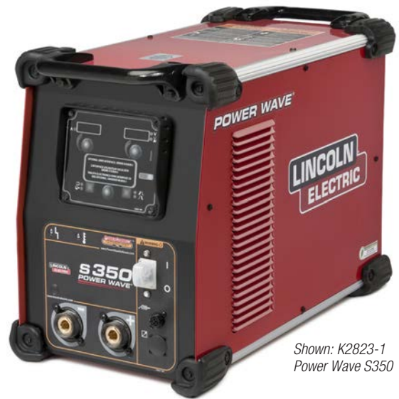
Shown: K2823-1 Power Wave S350