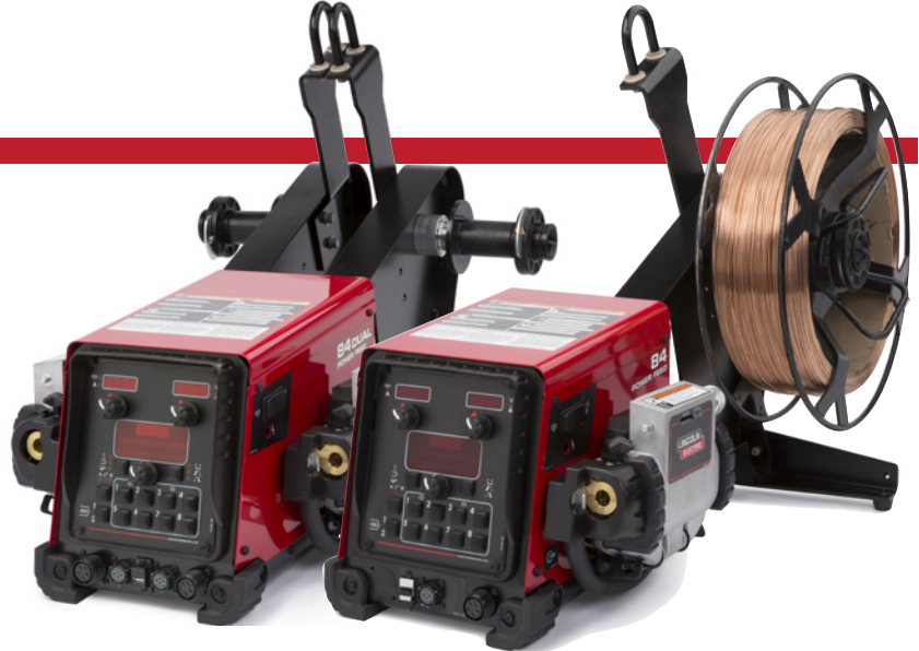
Power Feed 84 Dual and Power Feed 84