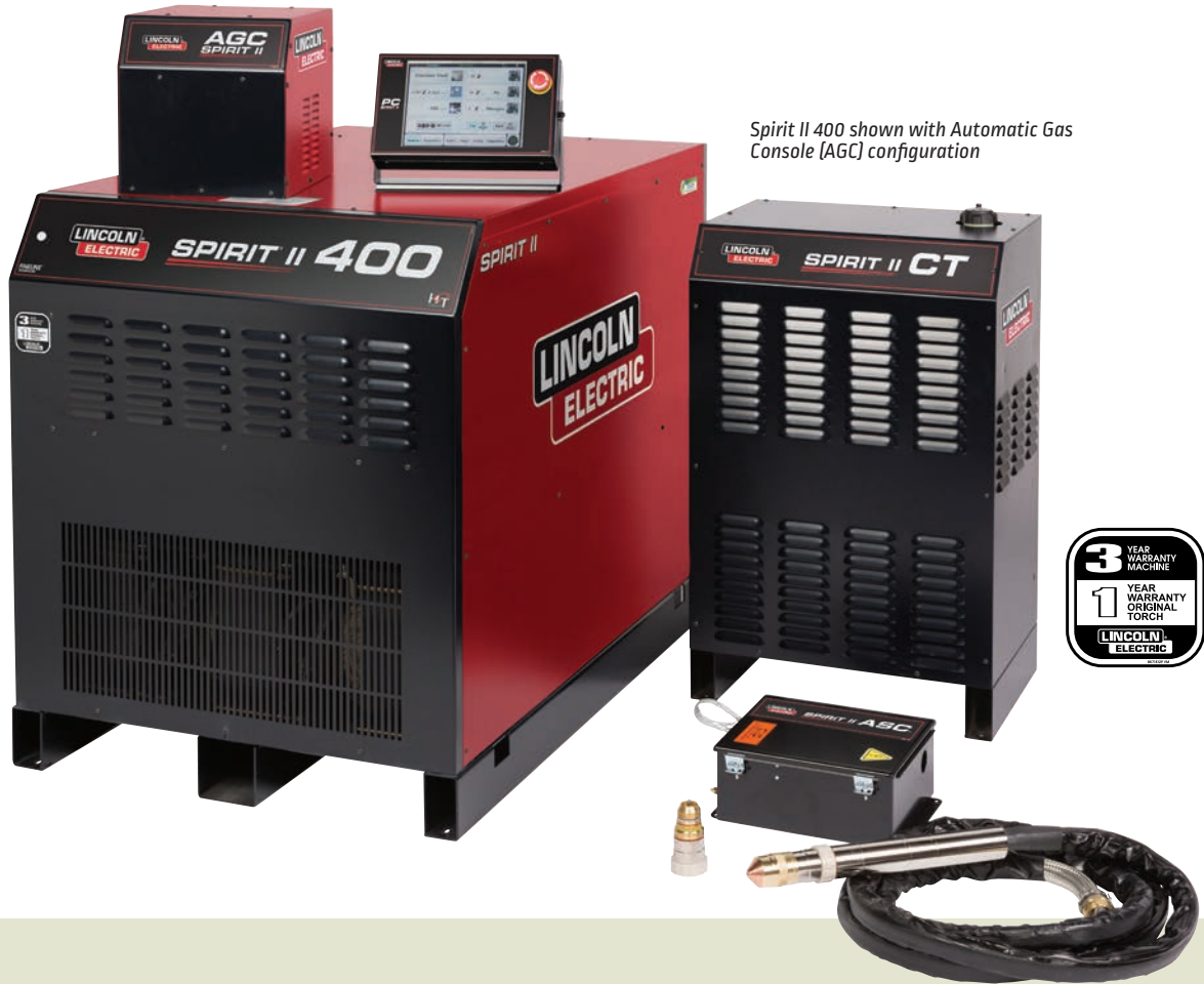
Spirit II 400 shown with Automatic Gas Console (AGC) configuration