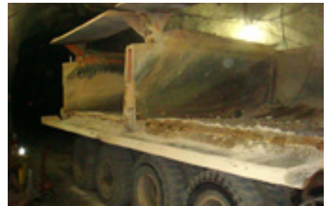
Weartech wear plates remain in service after hauling over 3 million tons in 28 months