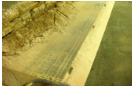
Weartech SHS9700U overlay wear plate, 1/4 in. (6 mm) overlay on 1/4 in. (6 mm) substrate