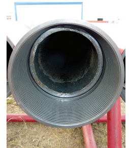
Male and female threaded joints are connected on site with zero difference couplings