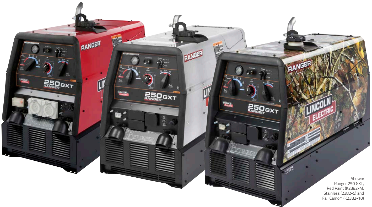
Shown: Ranger 250 GXT, Red Paint (K2382-4), Stainless (2382-5) and Fall Camo™ (K2382-10)