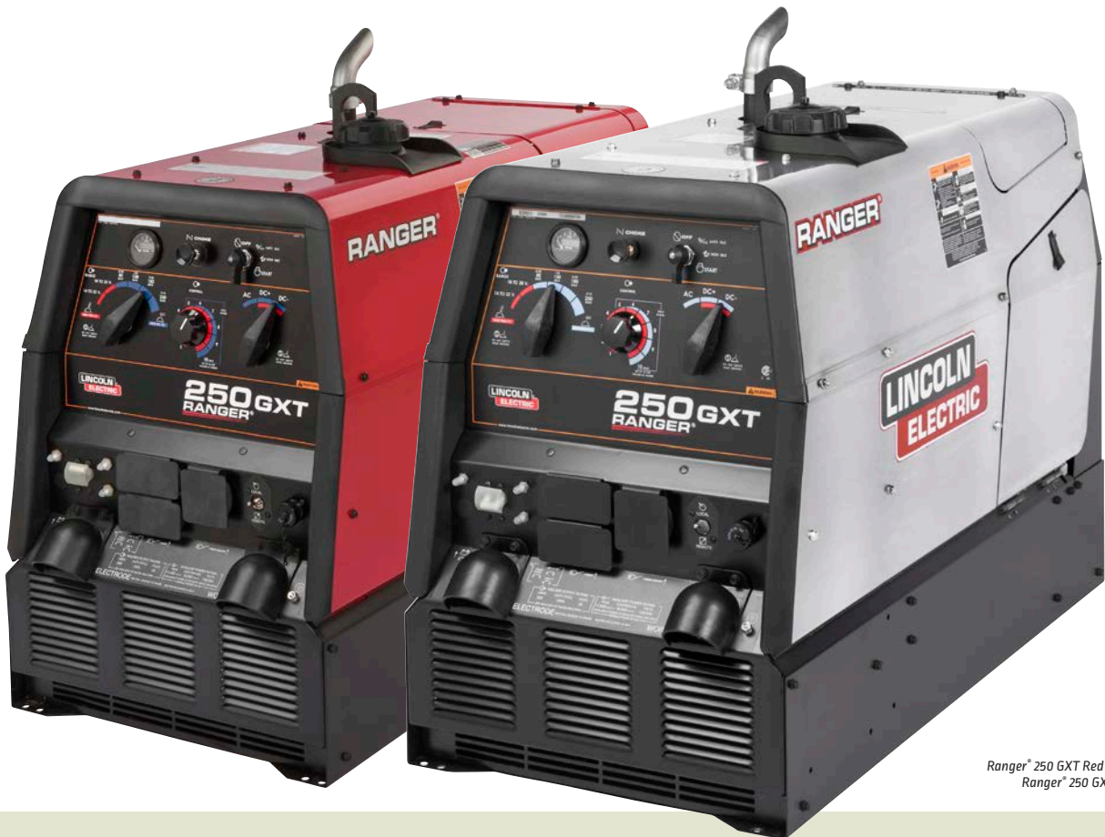
Shown: Ranger® 250 GXT Red Paint (K2382-4) and Ranger® 250 GXT Stainless (2382-5)