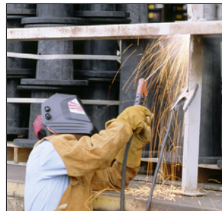
DC stick welding