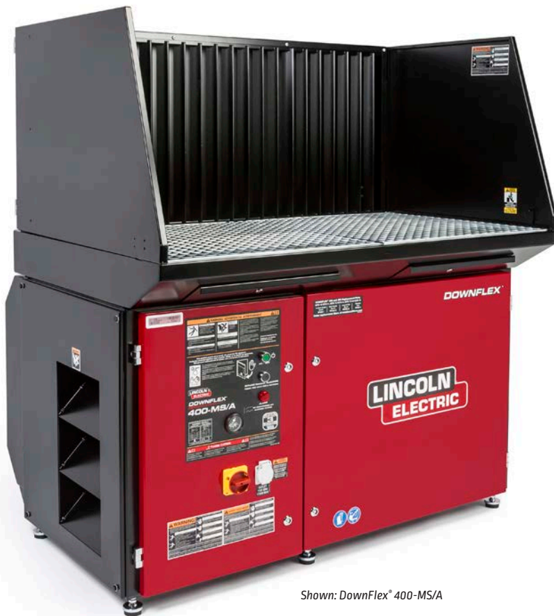
Shown: DownFlex® 400-MS/A