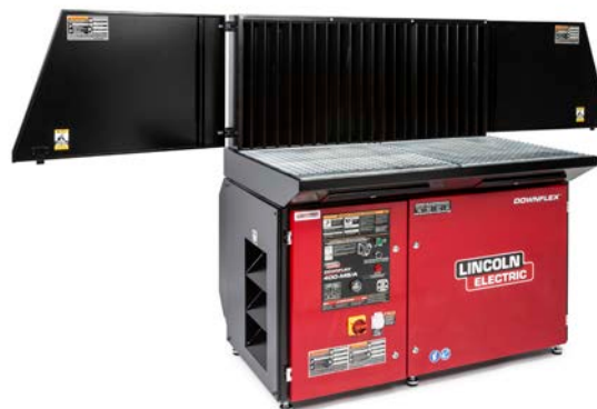
Left and right side panels swing open to allow for larger parts to be placed on the work surface.