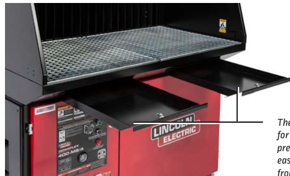
The lockable dust drawers for the second stage pre-filtration area are easily accessed from the front of the DownFlex table.