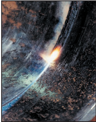
Inside of an 8 in. x 0.375 in. wall API 5L-X52 pipe, welded in 5G position.