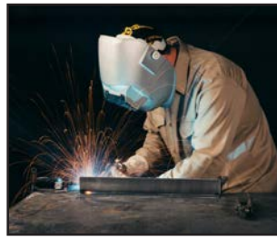
Conventional CV short circuit transfer using carbon dioxide (CO 2 ) and 0.045 in. solid wire.

For more information see Nextweld® Document NX-2.20