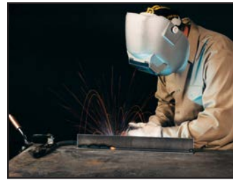
STT using CO 2 and 0.045 in. solid wire (Note reduced spatter and fume).