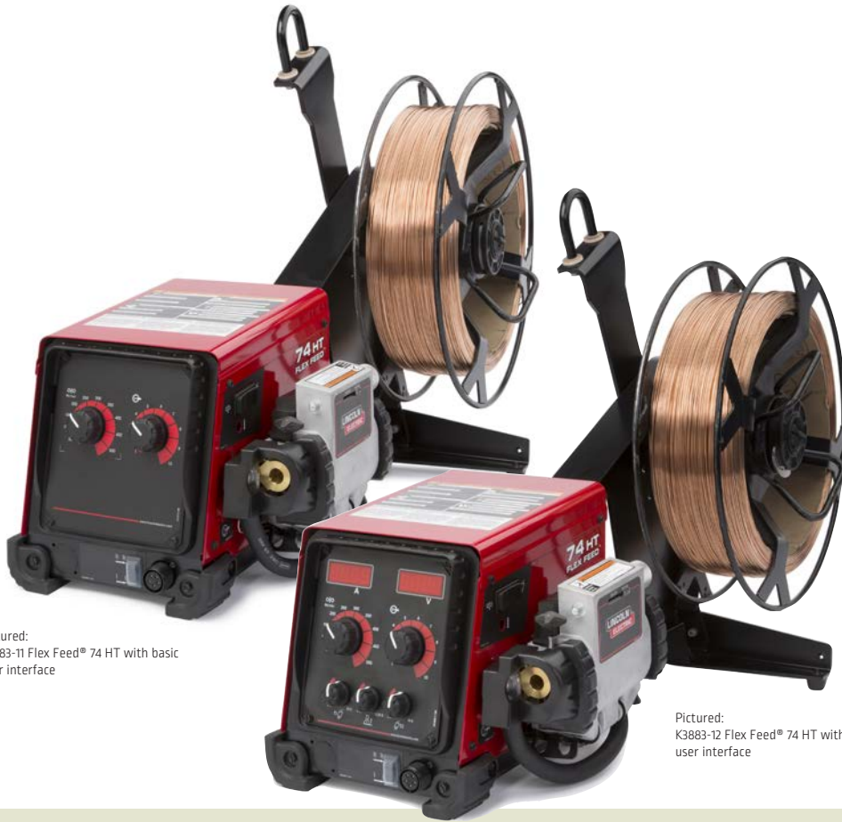
Pictured: K3883-11 Flex Feed® 74 HT with basic user interface