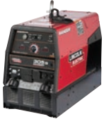
LINCOLN Ranger® 305 G and 305 G EFI