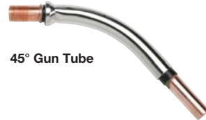
45° Gun Tube