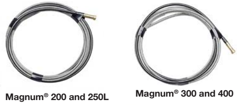
Magnum® 200 and 250L