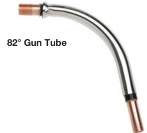
82° Gun Tube