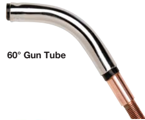
60° Gun Tube