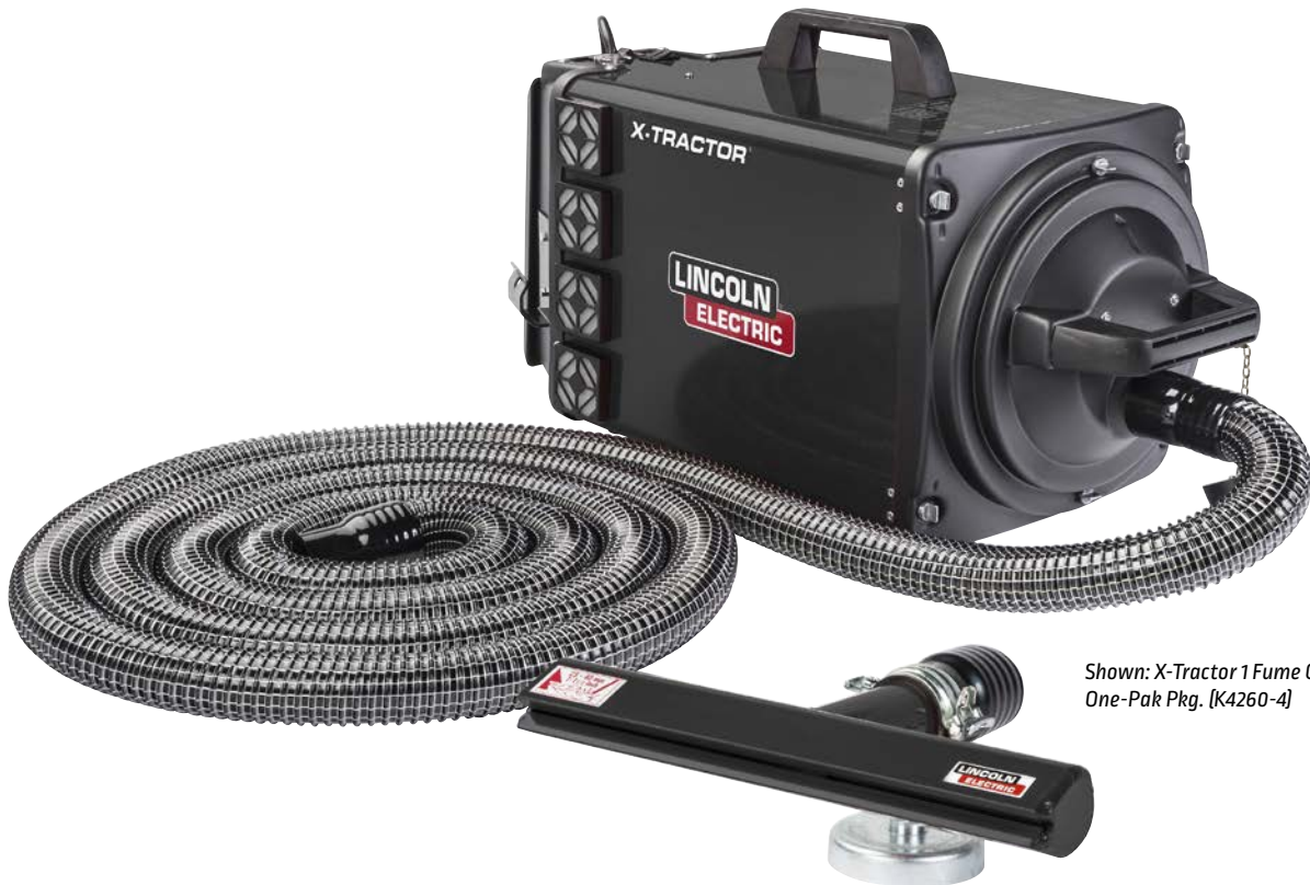
Shown: X-Tractor 1 Fume Gun One-Pak Pkg. (K4260-4)