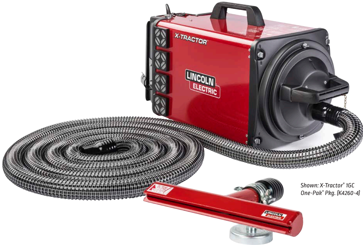
Shown: X-Tractor® 1GC One-Pak® Pkg. [K4260-4]