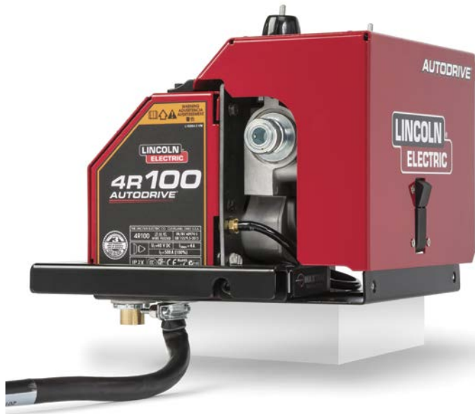
Shown: AutoDrive® 4R100

Powerful and Dependable Robotic Wire Feeders