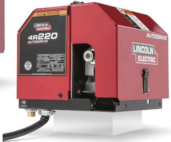
Shown: AutoDrive® 4R220