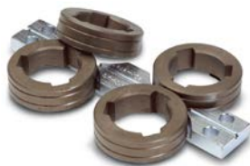
Shown: AutoDrive® 4R220