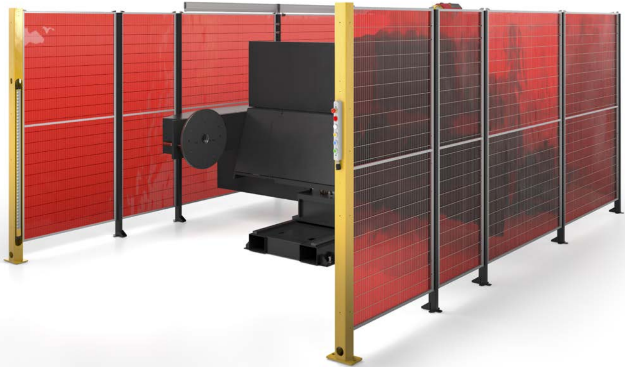
Representative design of a standard robotic welding cell

Pre-engineered robotic welding systems from Lincoln Electric Automation™, including the Fab-Pak™ XHS, can enhance part production by improving productivity, quality and safety. The Fab-Pak XHS standard robotic welding cell is a two zone with a center or rear mounted robot on an H-Frame positioner. The H-Frame positioner will rotate 180 degrees to allow single load/unload access point. Each zone contains a headstock which is used for reorientation of small to medium sized parts. It allows more welding to be done with a smaller arm and in a smaller overall system footprint.