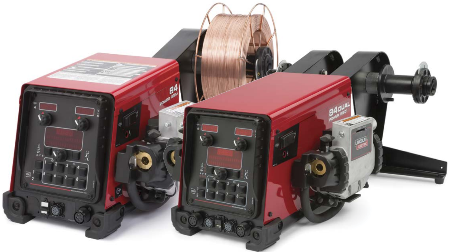
Shown: Power Feed 84 - Single (K3328-7) Power Feed 84 - Dual (K3330-7)