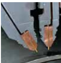
Narrow welding head