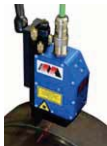
Scanning laser tracking