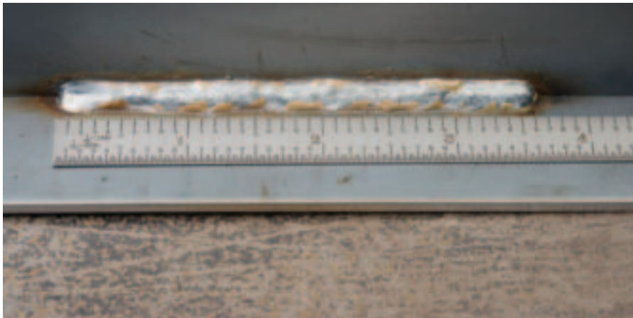
Fig. 4 — The heat input is calculated by taking the final energy value and dividing it by the length of the weld.

software.com. For a power source that doesn't support the display of energy or power, external meters are available. A meter with demonstrated accuracy in this application is the Fluke® 345 Power Quality Clamp Meter.