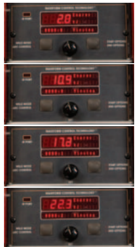
Fig. 3 — The real-time energy is continuously incremented while welding, and the final energy is displayed until the next arc start.

must be obtained using a meter that captures the brief changes in a welding waveform and filters out extraneous noise. The simplest place to obtain this is from the welding power source. Many power sources that output pulsing waveforms will display these readings, although some might require software upgrades to enable this. Details and software upgrades for Lincoln Electric’s Powerwave “M” series and several other models are available free of charge at www.powerwave