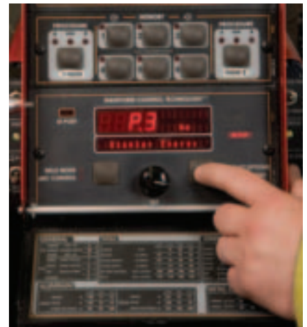
Fig. 2 — With the proper software installed, access to the energy reading entails pressing the menu option “Display Energy.”

To use method (c) of the code, a reading of energy (Joules) or power (Joules/s)