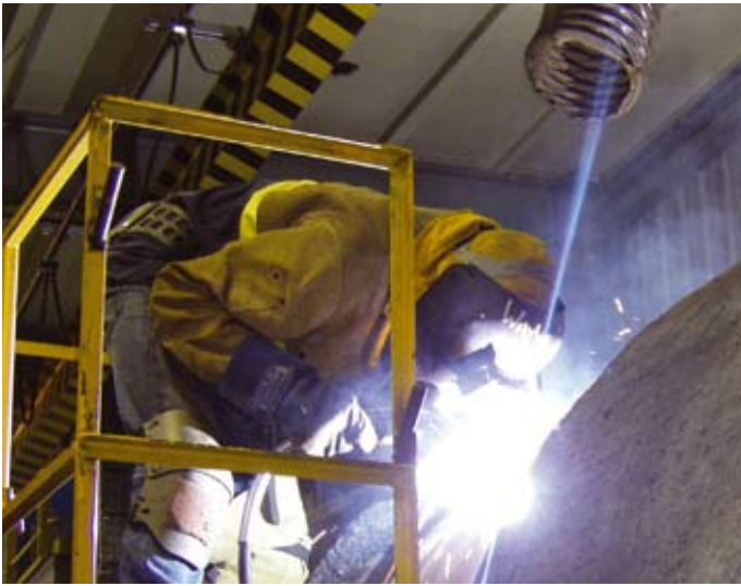
Outershield® 71Mx wire was used for the fill and cap passes, significantly improving productivity.