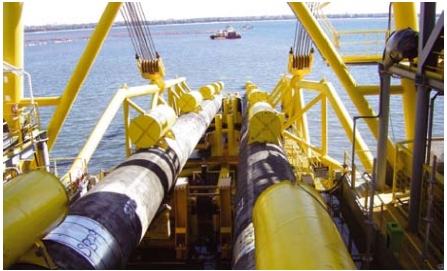
The twin pipeline being laid into Botany Bay.

The Invertec® 350PRO plug-and-play intelligence allowed it to automatically adjust to Lincoln wire feeders and remote controls - instantly. The new Lincoln