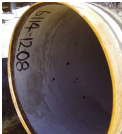
The X60 grade, 17.5mm pipe used for the project.

Lincoln Electric's Inverter® 350PRO multi-process inverter welding machine is the most powerful portable inverter power source in its class. Complemented by a tough build, the compact machines impressed Standish Constructions throughout the project.