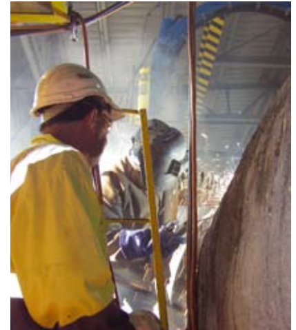
Lincoln Electric Pipeliner 6P+ was used for the root runs.

Extra welding time would have meant significantly greater cost as the pipe sections were being joined on a barge, fitted with twin welding bays, impacting not only welding