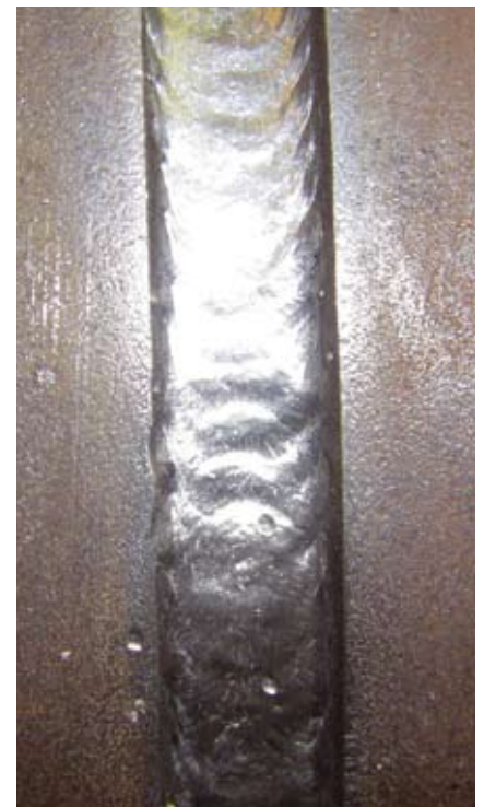
A finished weld.