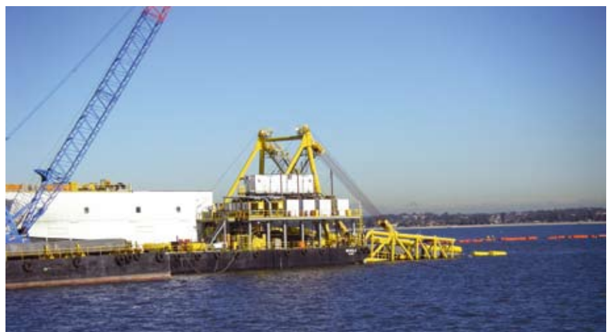
The twin pipeline sections needed to be welded as quickly as barge operators could deliver them to meet deadline and cost objectives.

If the project was to be completed within the required five month time frame, a different welding technique needed to be implemented. In consultation with Lincoln Electric, a process was developed where the root run was laid down using Lincoln Electric® Cellulosic all position stick electrodes, Pipeliner® 6P+, with 5P completing the hot fill and pass. This was followed by a flux-cored, gas-shielded wire