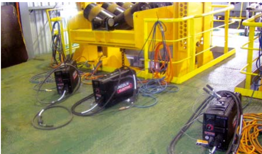
The LN-25PRO wire feeders offered high operator appeal with the trigger-lock function.