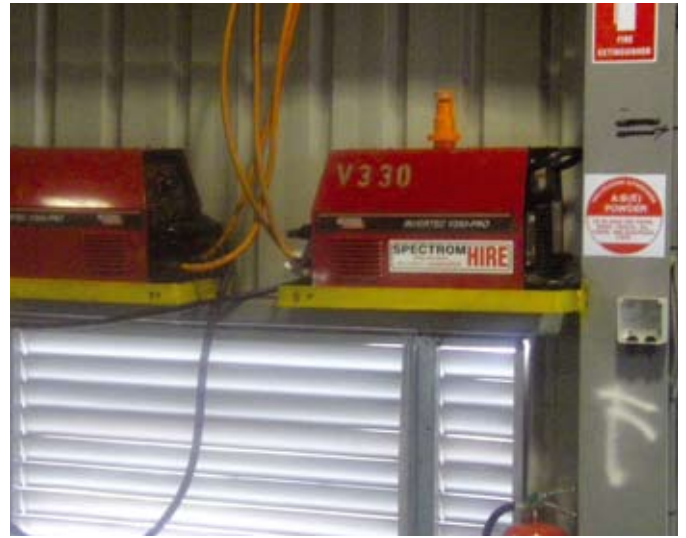
Lincoln Electric's Inverter® 350PRO offered the versatility, performance and robustness for the project in a compact package.

electrode - Outershield® 71MX wire - to fill out the deep weld preparation.