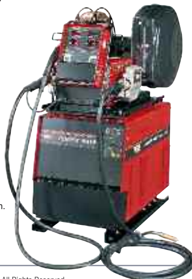
Power Wave® 455M/STT® Superior Arc Performance. Revolutionary Communication.

How does this differ from previous methods of calculating heat input? The traditional method of calculating heat input involves measuring the average voltage and average current. While this method produces relatively consistent results with high energy processes, such as traditional spray arc, the results become less consistent and accurate with short arc and pulse modes due to the rapidly changing output of the machine.