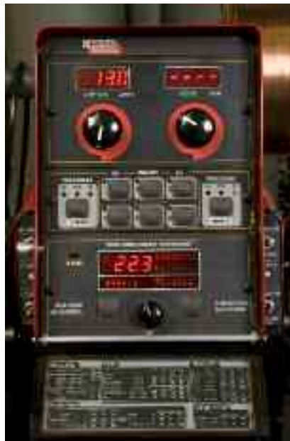
True Energy™ results can be displayed on a Power Feed™ series wire feeder.

The True Energy™ heat input is accurate based on the welding parameters output by the machine. Various factors can influence the data’s accuracy such as circuit resistance and arc efficiency in the welding circuit. Independent verification of the results is still recommended. Lincoln Electric does include a computer based method for testing welding circuit resistance and inductance, which can be used to verify that the values present during welding are similar to those during qualification. This testing system is part of the free Diagnostics software package for all Power Wave® units.